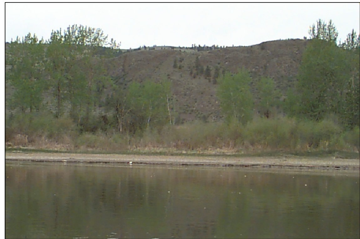
RIGHT BANK VIEW