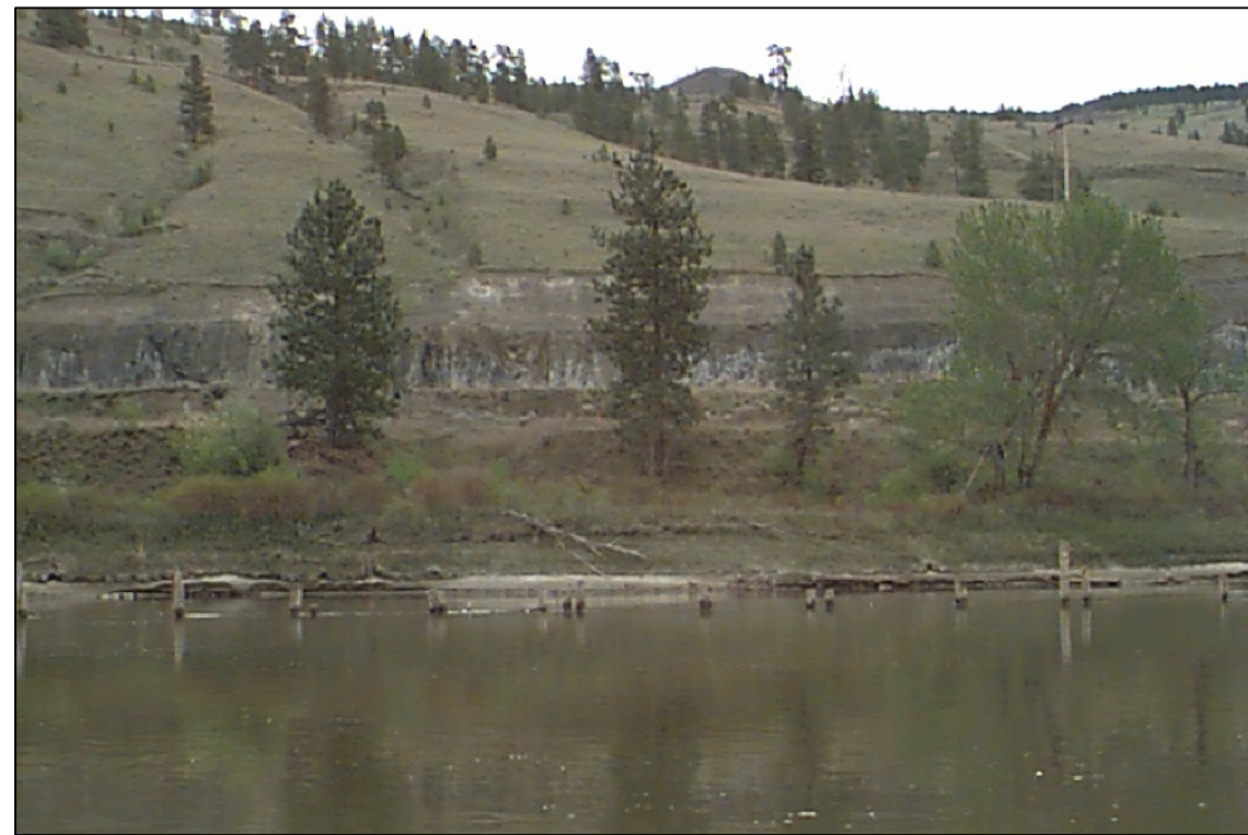
LEFT BANK VIEW